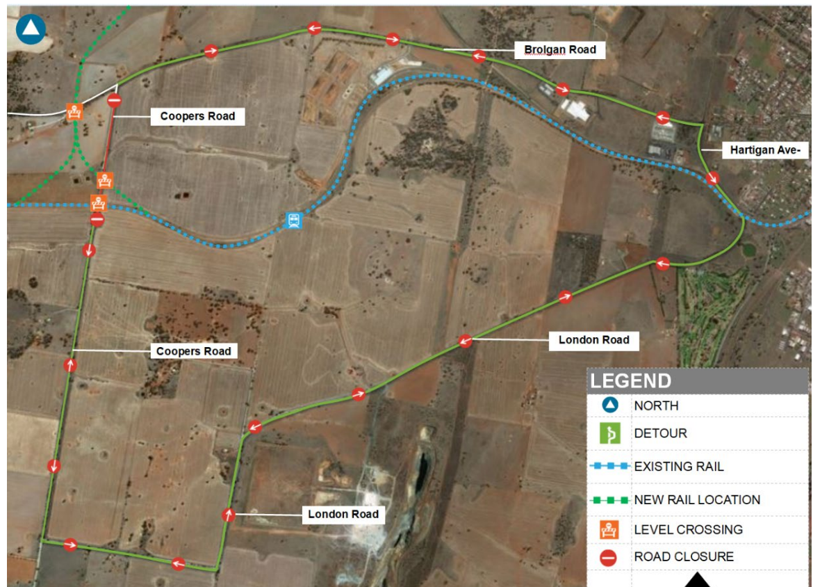
This is an artist's impression only and is not to scale

We can be contacted 24 hours a day, 7 days a week on 1800 732 761 .