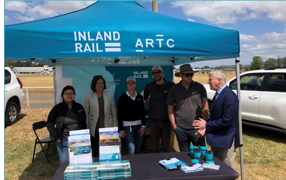
Deputy Prime Minister Michael McCormack visiting the Inland Rail marquee, Cootamundra Show, October 2019. Inland Rail attendance at regional shows during 2020 is TBC.