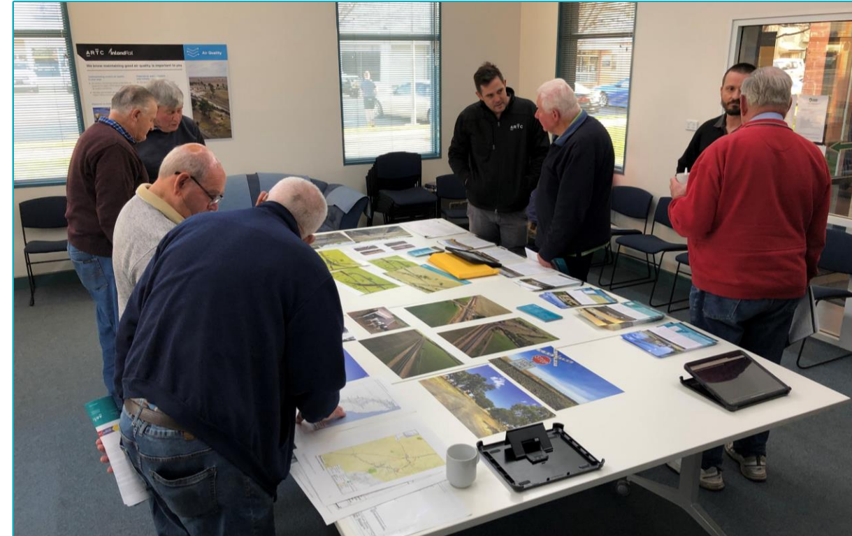
Visitors at community information session held at the Cootamundra Library, August 2019.