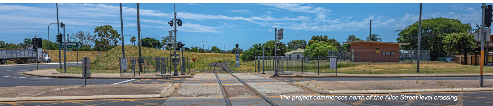
The project commences north of the Alice Street level crossing

Investigations, detailed design and consultation will continue as the project approaches construction, which is expected to begin in late 2025.