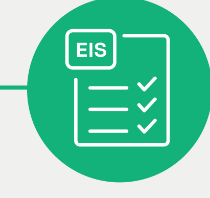
Annual public sustainability reporting