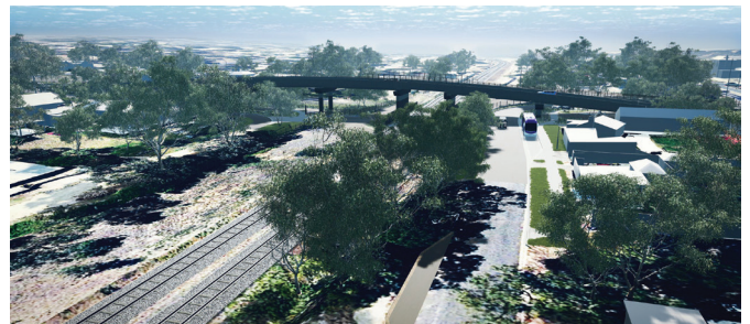
View looking along Woolshed Road towards Beaconsfield Parade bridge.