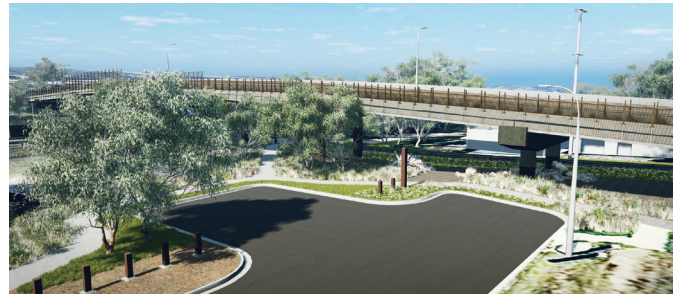
A pathway network will connect heritage sites in Glenrowan. Siege Street East will incorporate a turnaround area and no longer intersect with Beaconsfield Parade.