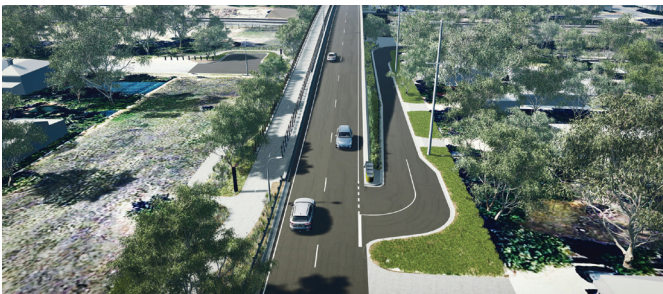
View looking south across Beaconsfield Parade bridge from Church Street.