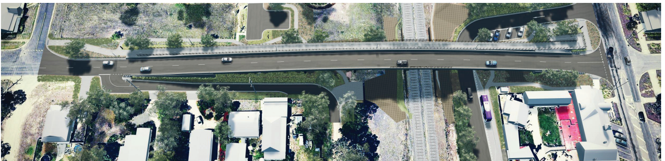
A birds-eye view of Beaconsfield Parade bridge.