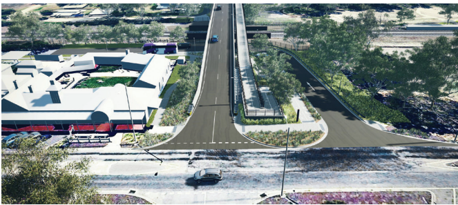
View looking across Beaconsfield Parade bridge from Gladstone Street.