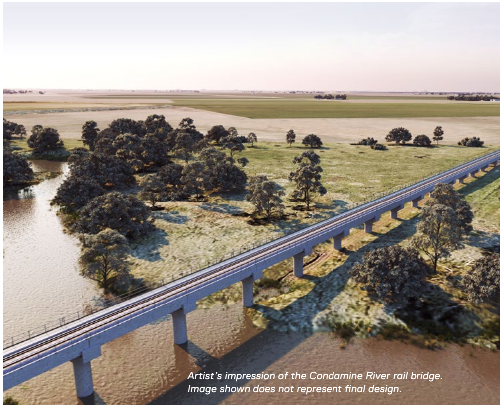
Artist's impression of the Condamine River rail bridge. Image shown does not represent final design.

Site investigations and field studies will continue as required to support the revised draft EIS. Investigations