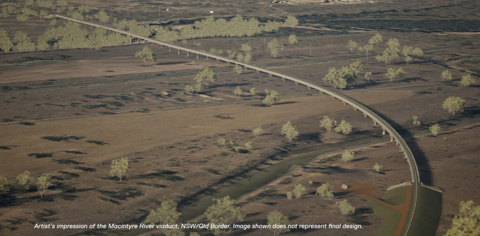
Artist's impression of the Macintyre River viaduct, NSW/Qld Border. Image shown does not represent final design.