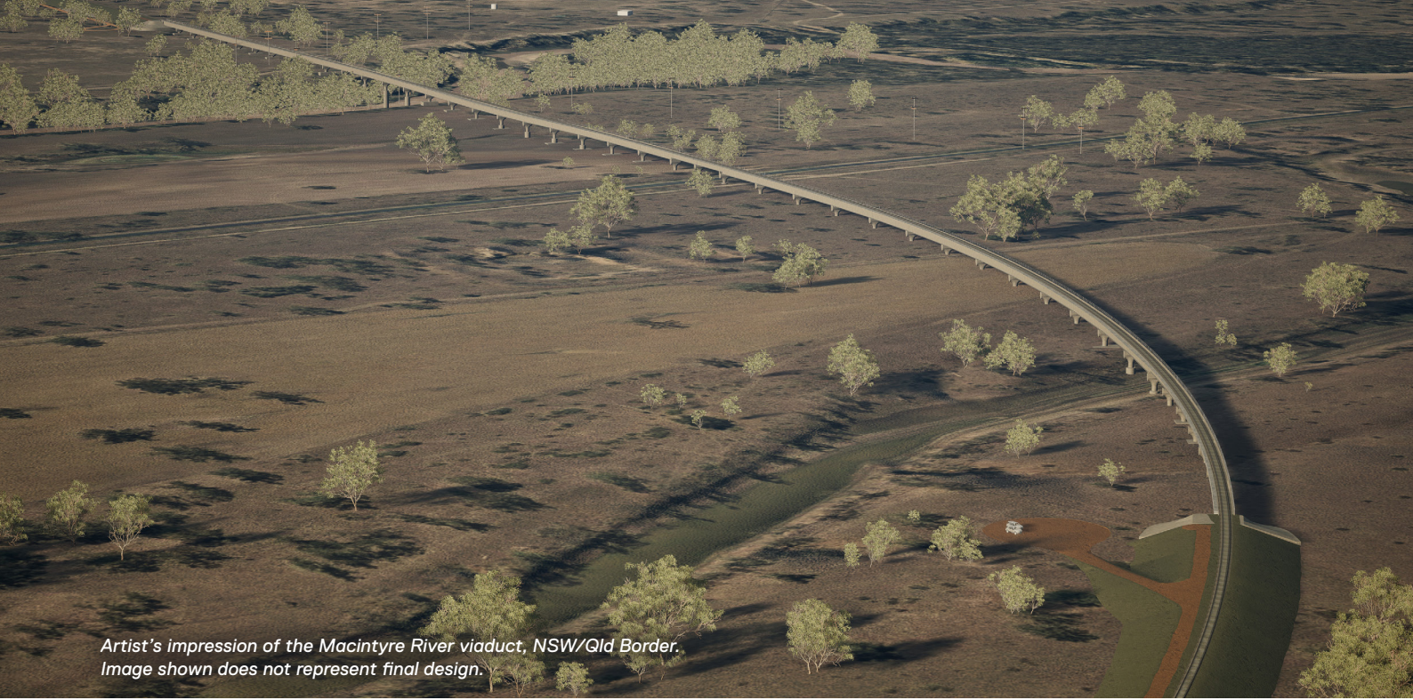
Artist's impression of the Macintyre River viaduct, NSW/Qld Border. Image shown does not represent final design.