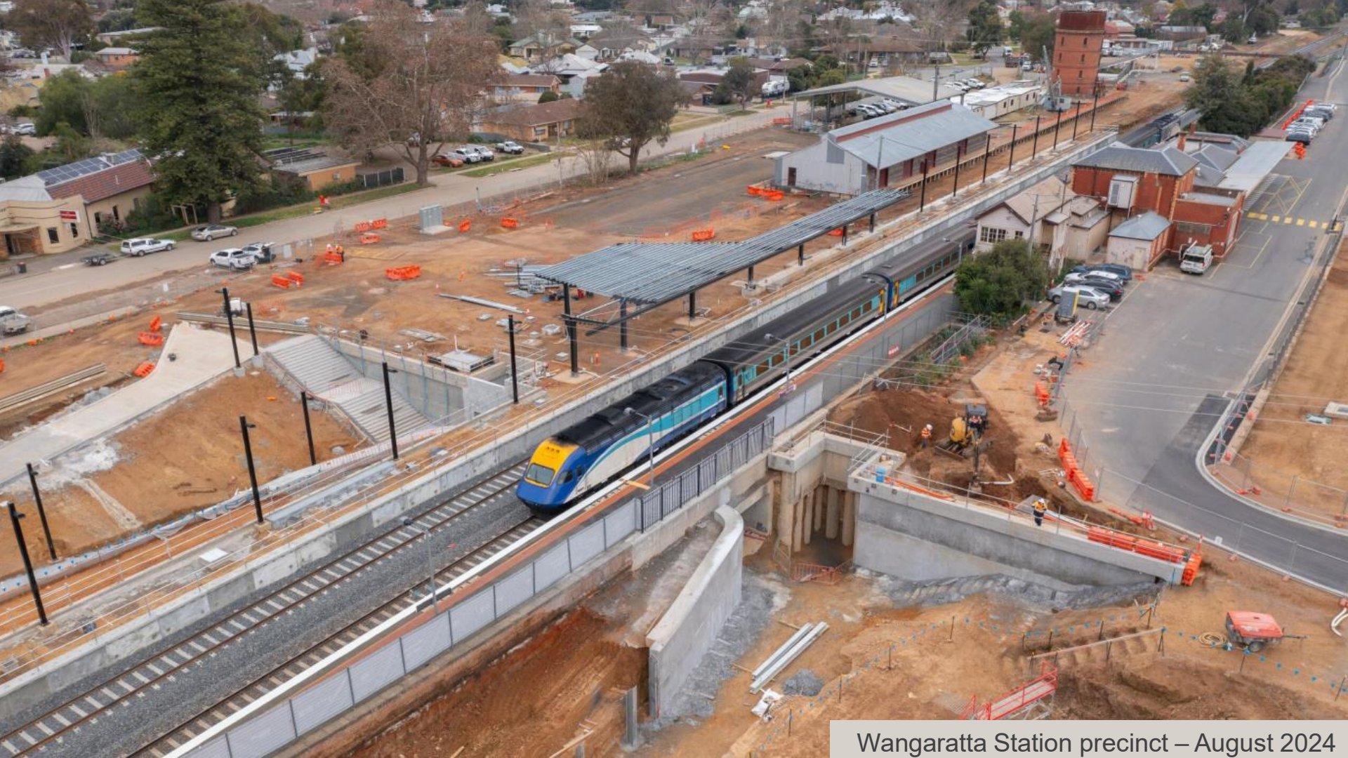
Wangaratta Station precinct – August 2024