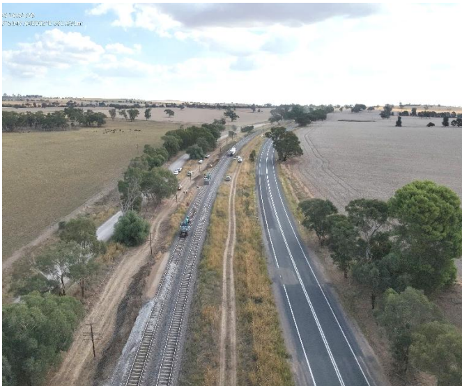
Site #5 - Junee to Illabo track works during the recent May possession. (3 - 5 May 2025)