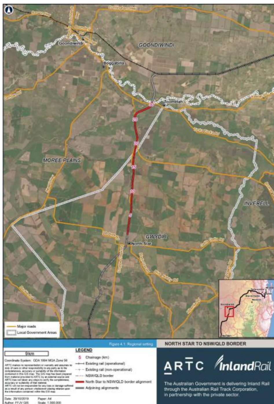
Figure 1 North Star to NSW/QLD border section of Inland Rail project footprint