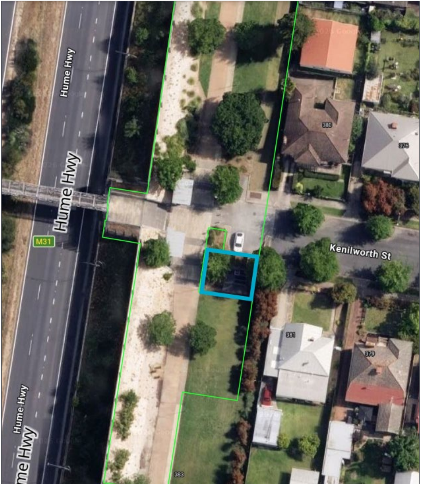
FIGURE 1: ADDITIONAL WORK AREA FOR W.001A (CNVIS ADDENDUM)