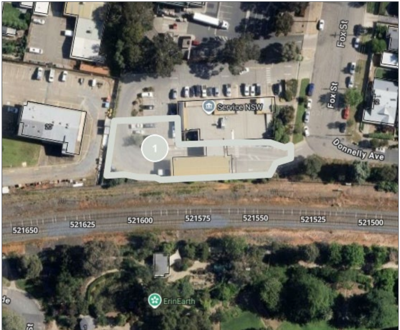
FIGURE 1: WORK AREA FOR W.002A (CNVIS ADDENDUM)

This CNVIS Addendum should be reviewed in conjunction with the endorsed CNVIS, including adopted rating background levels (RBLs), noise management levels (NMLs) and assessment criteria in accordance with the Infrastructure Approval (SSI-10055). The following figure identifies the work area assessed in this CNVIS Addendum.