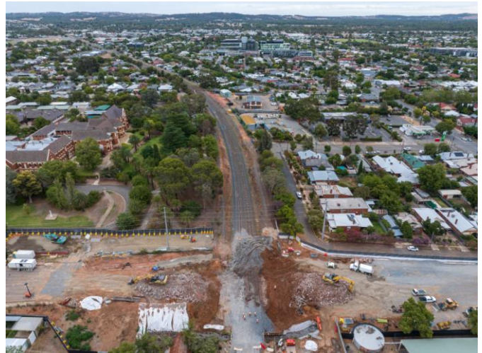
Photo: Edmondson bridge removed.

If you have questions or complaints about this or any of our works, please call 1800 732 761 or email inlandrailnsw@inland.com.au