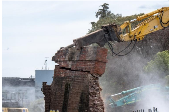
Photo: Edmondson bridge demolition.