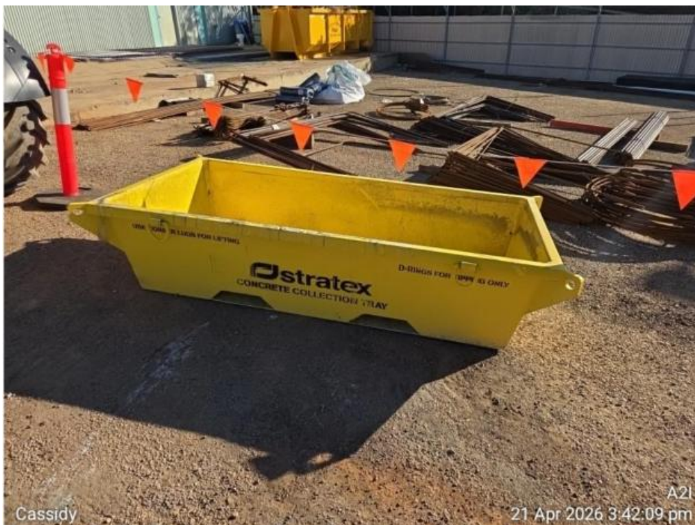
Figure 3. Cassidy St – steel concrete washout skip bin to enable concrete recycling (21/04/26)