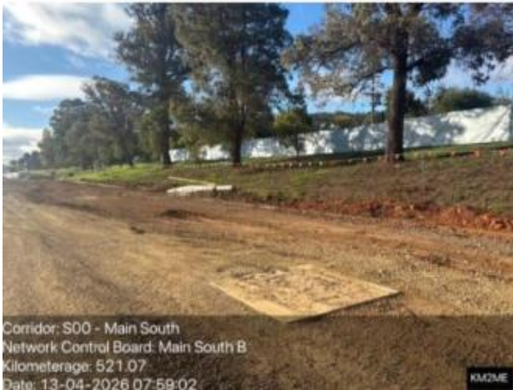
Figure 2. Wagga Wagga Yard – flagging to delineate no-go areas (13/04/26 MR)