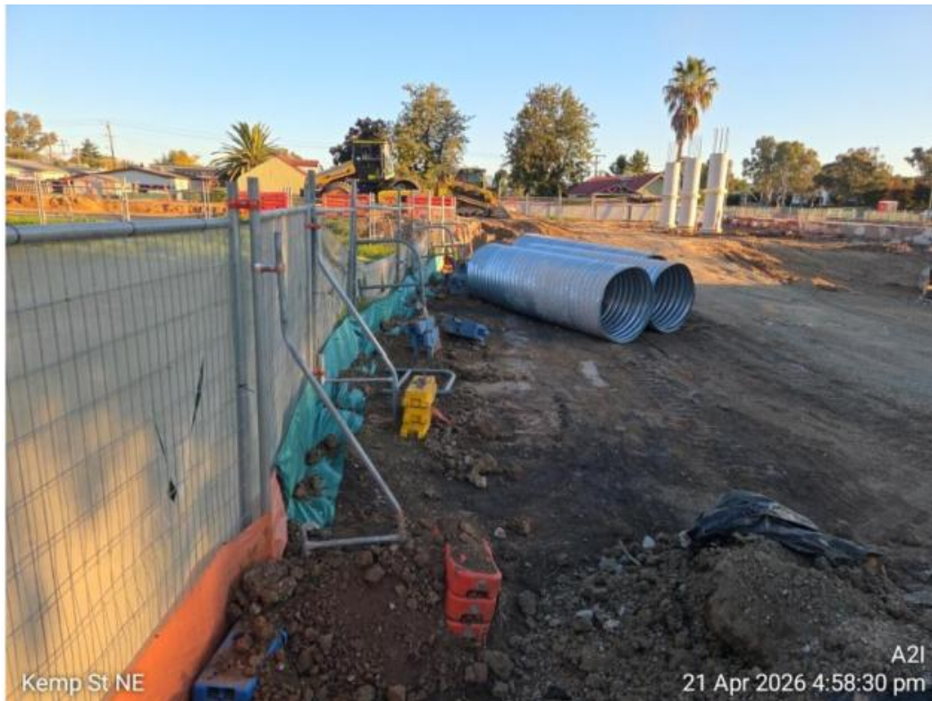
Figure 6. Kemp St – incorrectly installed sediment fence requiring reinstatement/maintenance (21/04/26)

ER inspections for the next reporting period are scheduled for 2-3 May (Possession – completed) and 19 May.