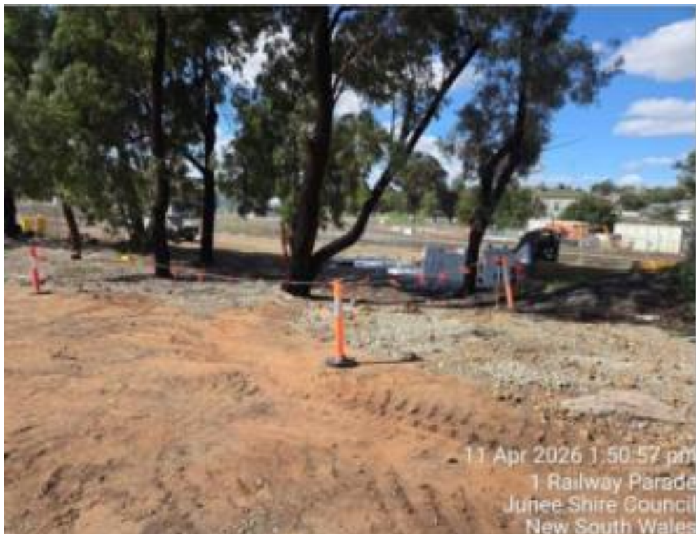
Figure 5. Junee Yard - flagging to delineate no-go areas (13/04/26 MR)