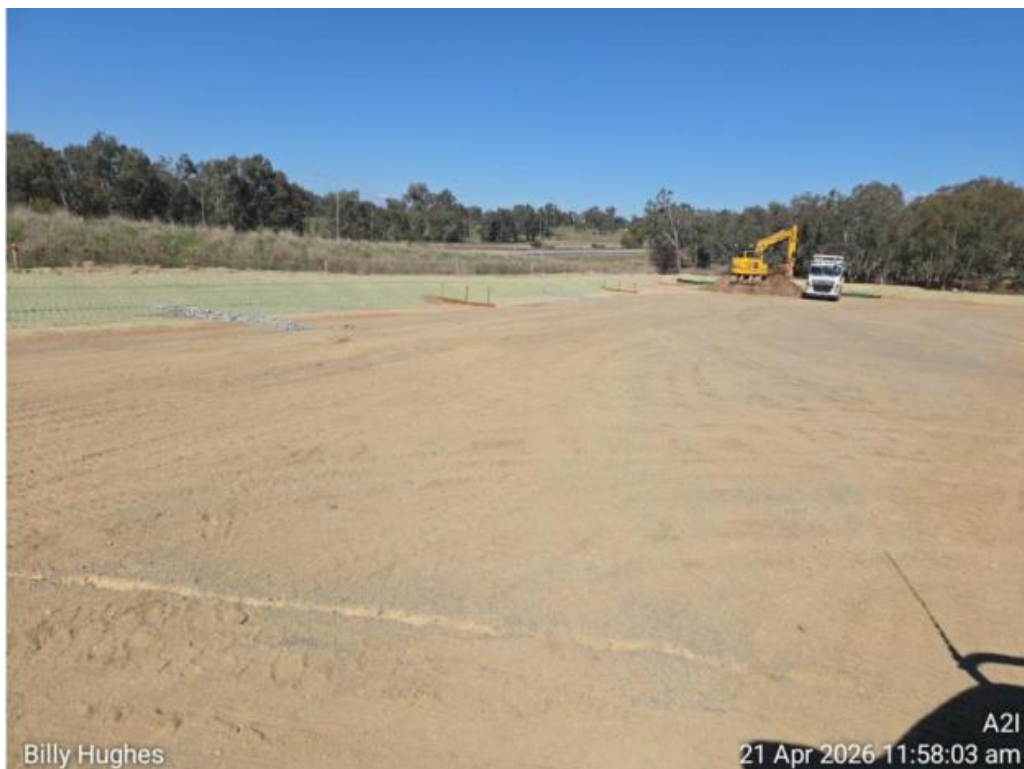
Figure 1. Billy Hughes Bridge – installation of eastern laydown with ESC measures in place (21/04/26)

Evidence of closeout of actions that remained open after the 21 April inspection was provided to the ER on 1 May. Site inspection photos are included in the Figures below.