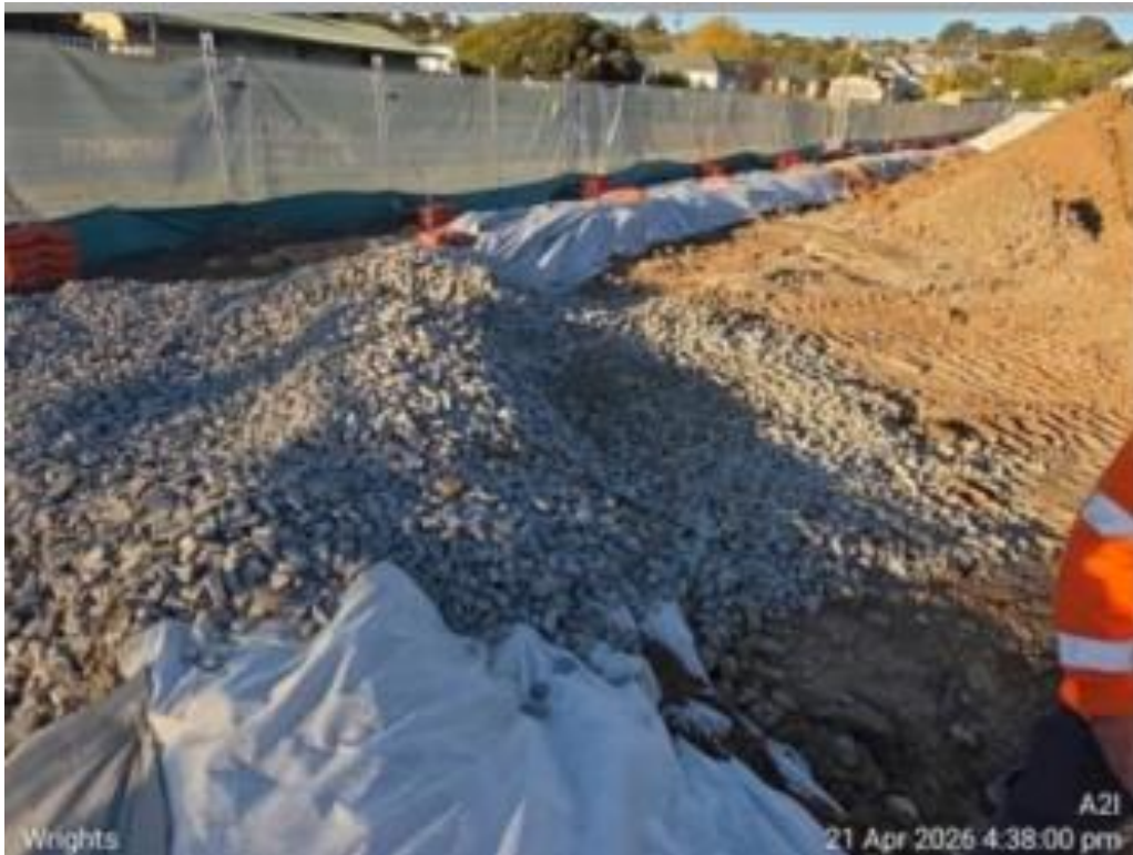
Figure 4. Wrights oval compound – installation of rock filter dam (21/04/26)