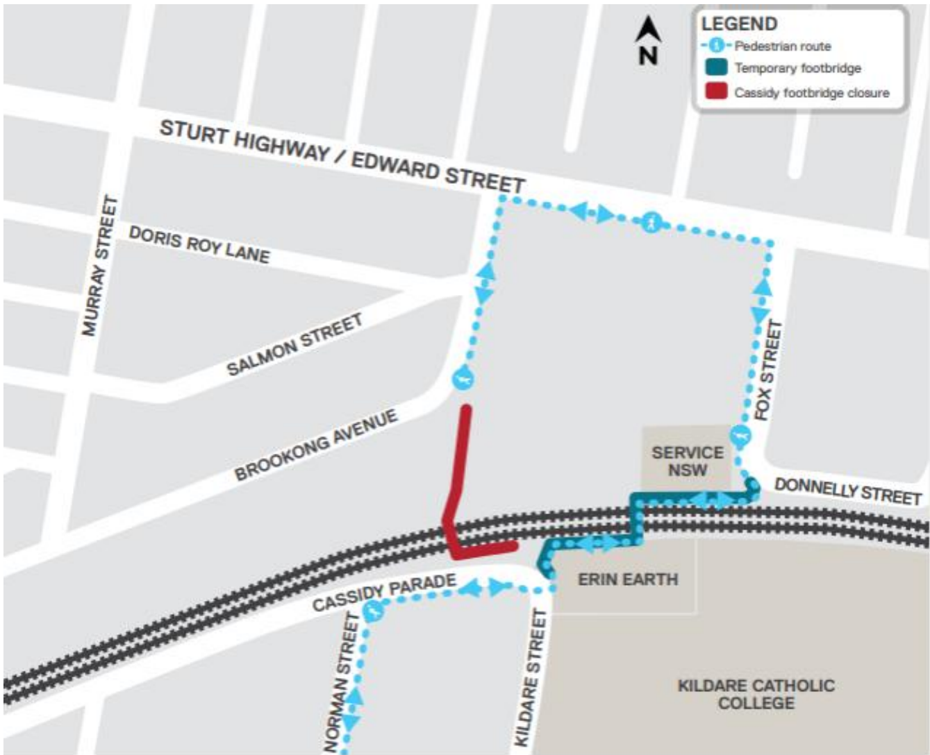
Map: Cassidy Parade Temporary Pedestrian footbridge exit Fox Street