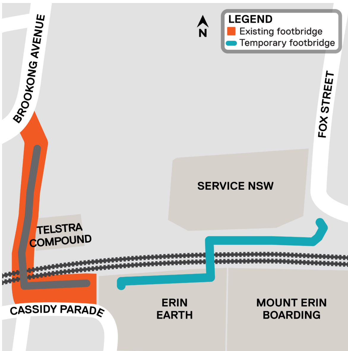
Map: Cassidy Parade work area.

Information about Inland Rail is available at https://inlandrail.com.au/